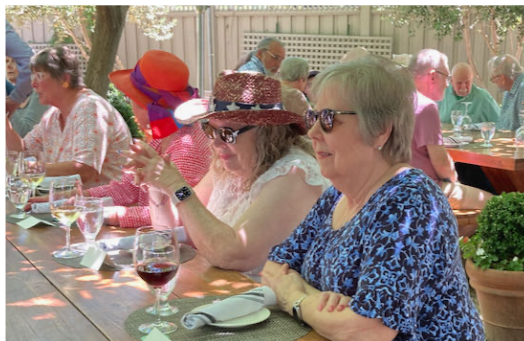
Annual Docent Luncheon at Calistoga Inn